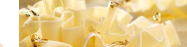
CHAMPAGNE CAKE MOUSSE OF REDUCED CHAMPAGNE, WHITE CHOCOLATE, MERINGUE STICKS RECOMMENDED WINE: CHAMPAGNE NECTAR IMPÉRIAL, FRANCE