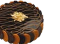
MAASAI EXTRA DARK CHOCOLATE MOUSSE, ORANGE MOUSSE, EXTRA DARK CHOCOLATE COULIS RECOMMENDED WINE: BANYULS, FRANCE