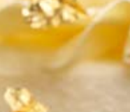
CHAMPAGNE CAKE MOUSSE OF REDUCED CHAMPAGNE, WHITE CHOCOLATE, MERINGUE STICKS RECOMMENDED WINE: CHAMPAGNE NECTAR IMPÉRIAL, FRANCE