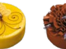
LEMON BUTTERFLY MOSCOVITE CAKE, LEMON COMPOSITION, MARZIPAN, LEMON COULIS RECOMMENDED WINE: ESSENSIA - ORANGE MUSCAT, US