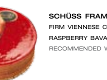
SCHÜSS FRAMBOISE FIRM VIENNESE CAKE, RASPBERRY COULIS, RASPBERRY BAVAROIS, RASPBERRY LIQUOR RECOMMENDED WINE: ELYSIUM - BLACK MUSCAT, US