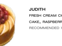
JUDITH FRESH CREAM CHEESE MOUSSE, MOSCOVITE CAKE, RASPBERRIES, MERINGUE FLAMBÉE RECOMMENDED WINE: DULCE TINTORALBA, SPAIN