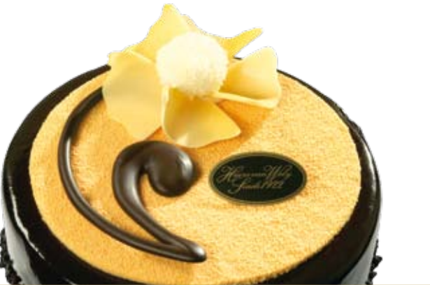
NUMBER ONE VIENNESE CAKE, CHERRY COMPOTE, WHITE AND MILK CHOCOLATE MOUSSE, APRICOT CRÈMEUX, PISTACHIO CAKE, CHERRY CRÈMEUX RECOMMENDED WINE: ELYSIUM - BLACK MUSCAT, US