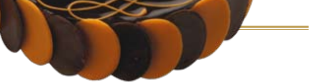
IVONÉE MOSCOVITE CAKE, CREAM CHOCOLATE, AIRY HAZELNUT MERINGUE, COFFEE LIQUOR AND COFFEE CREAM RECOMMENDED WINE: PELLEGRINO PANTELLERIA, ITALY