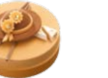
MONET PISTACHIO, MOSCOVITE CAKE, APRICOT CRÈMEUX, NOUGAT DE MONTÉLIMAR MOUSSE, BRETON VIENNESE CAKE RECOMMENDED WINE: SAUTERNES, FRANCE