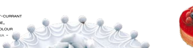
ANGEL MOSCOVITE CAKE, RASPBERRY-CURRENT CONFITURE, CRÈME AU BEURRE, CHIPOLATA FILLING, IN ANY COLOUR RECOMMENDED WINE: ESSENSIA - ORANGE MUSCAT, US