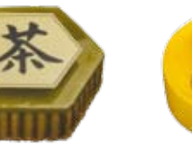
NIPPON MATCHA MOSCOVITE GREEN TEA CAKE, TEA CRÈMEUX, MATCHA CONFITURE, WHITE CHOCOLATE BAVAROIS RECOMMENDED WINE: SAKE, JAPAN